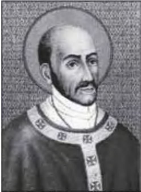
SAINT TURIBIUS of MOGROVEJO (1538 – 1606) Patron of Native Rights' Feast Day – March 23

The new archbishop of Lima, Peru, Turibius undertook to travel throughout the rugged and mountainous diocese, where he observed many of the worst effects of colonialism – both upon the enslaved and oppressed natives, and on many of the colonists who seemed to have lost their souls in the pursuit of wealth.